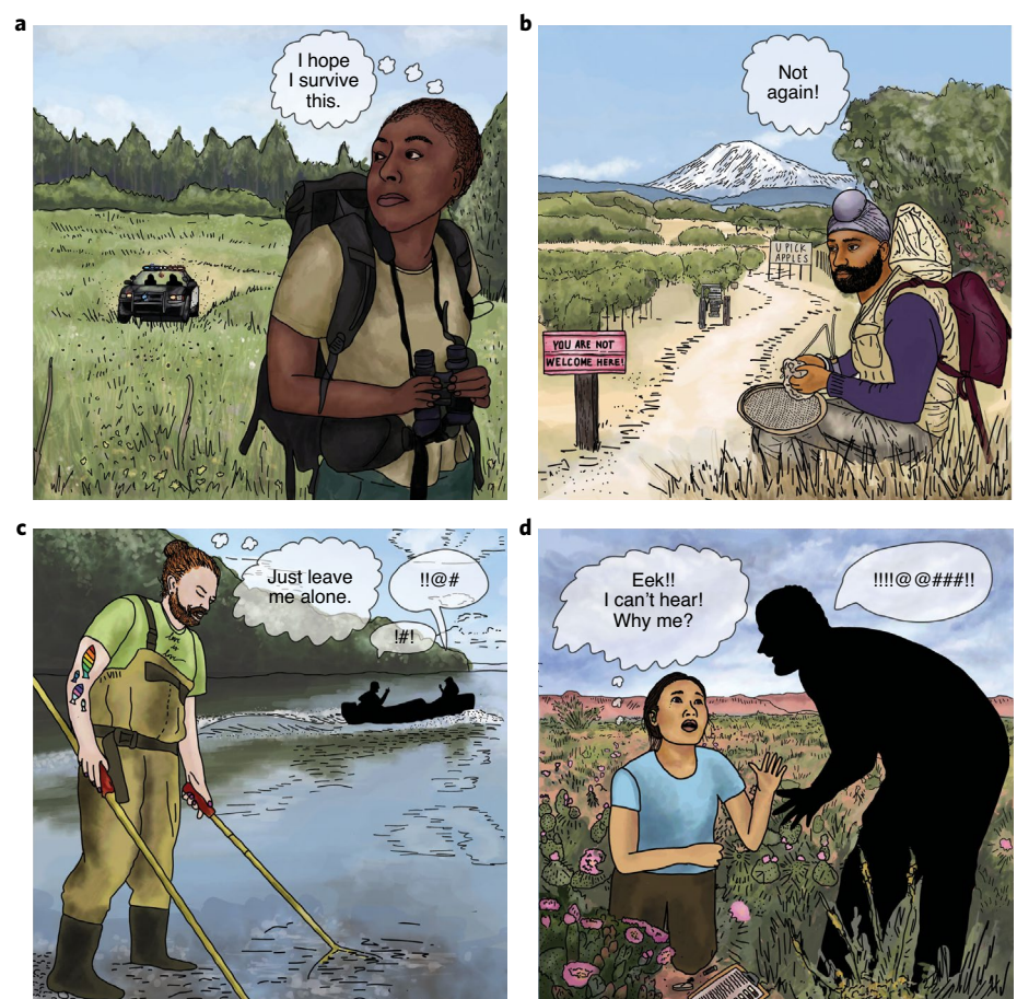
Fig. 1 | Example situations experienced by at-risk individuals in the field. a , A Black ornithologist is approached by law enforcement. b , A Sikh entomologist experiences a hateful landscape. c , A bisexual ichthyologist is accosted by hate speech. d , A deaf botanist is verbally abused due to her disability. Illustration by Callie Rodgers Chappell.

Given the value of a diverse scientific community (for example, see refs. 2–7), the increased risk to certain populations in the field — and the actions needed to protect such individuals — must be addressed by the entire scientific community if we are to build and retain diversity in disciplines that require fieldwork. While many field-based disciplines are aware of the lack of diversity in their cohorts, there may be less awareness of the fact that the career advancement of minoritized researchers can be stunted or permanently derailed after a negative experience during fieldwork (for example, see refs. 1,8).