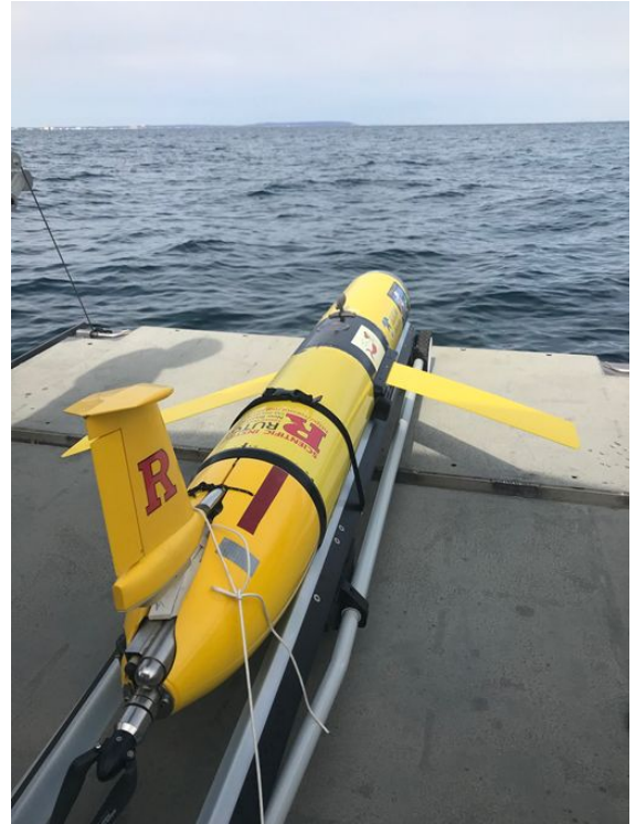
Deployment out of Sandy Hook, NJ, USA (above & below)

The seasonal glider deployments also flew through Atlantic sea scallop ( Placopecten magellanicus ) and Atlantic surfclam ( Spisula solidissima ) fishery grounds, providing a look at the carbonate system dynamics these species experience throughout a year. The data from these deployments is currently being integrated into laboratory and modeling experiments to investigate the effects of seasonal carbonate dynamics on larval shellfish success.