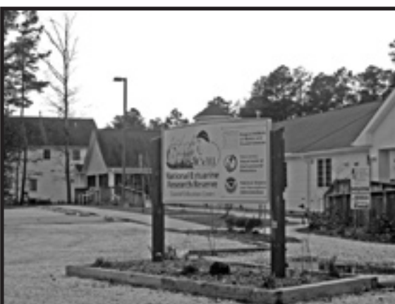
The Jacques Cousteau National Estuarine Research Reserve includes the Rutgers Institute of Marine & Coastal Sciences, the Jacques Cousteau Coastal Center and the Rutgers University Marine Field Station. As part of the effort, they have a myriad of public education programs including a recent session on New Jersey seals.