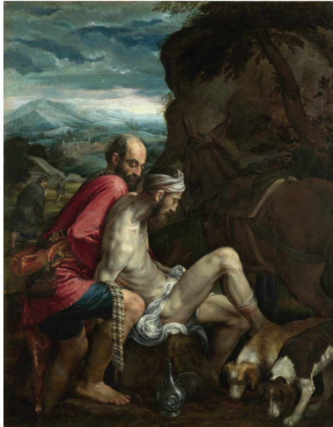
Fig. 1. In the parable of The Good Samaritan [painting by Jacopo Bassano, d. 1592, copyright 2006, The National Gallery, London], Christ preaches universal compassion and prosocial behavior. A similar message is found in many religions. Modern research from social psychology, experimental economics, and anthropology suggests, however, that religious prosociality is extended discriminately and only under specific conditions.

In several behavioral studies, researchers failed to find any reliable association between religiosity and prosocial tendencies. In the classic “Good Samaritan” experiment (22), for example, researchers staged an anonymous situation modeled