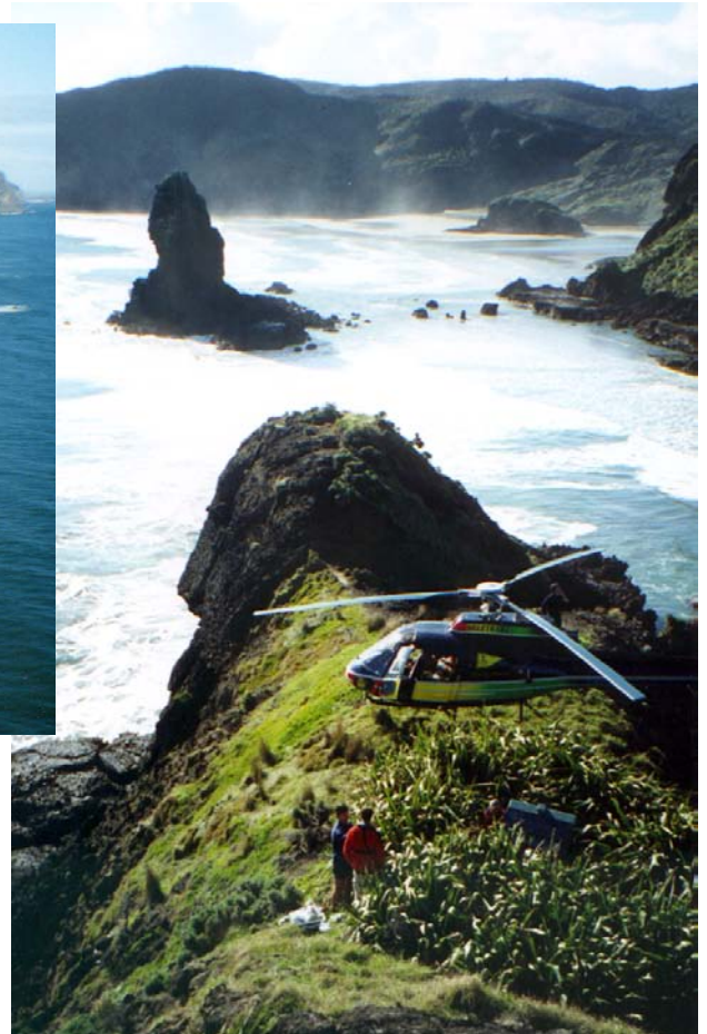
NIWA sea level recording site, Anawhata, west coast New Zealand.